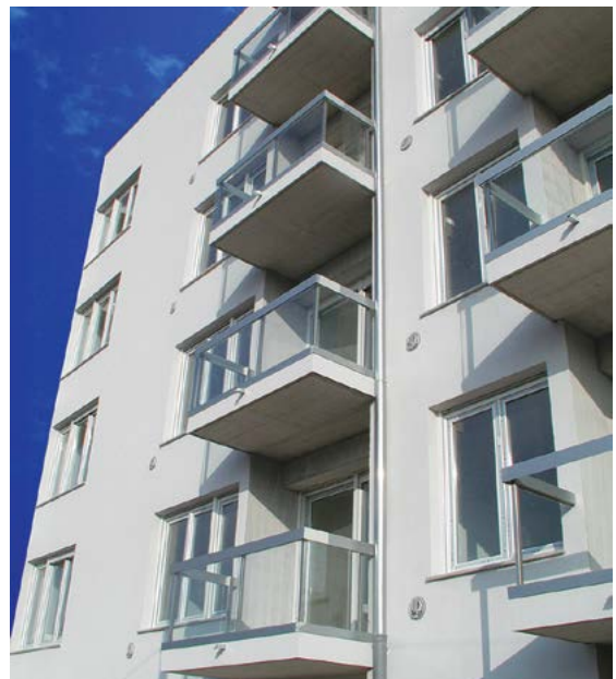
↓ UKT's units installed in apartments. Just a discreet 8" diameter grille visible on the building exterior. The grille can be colour coded to match the surroundings.