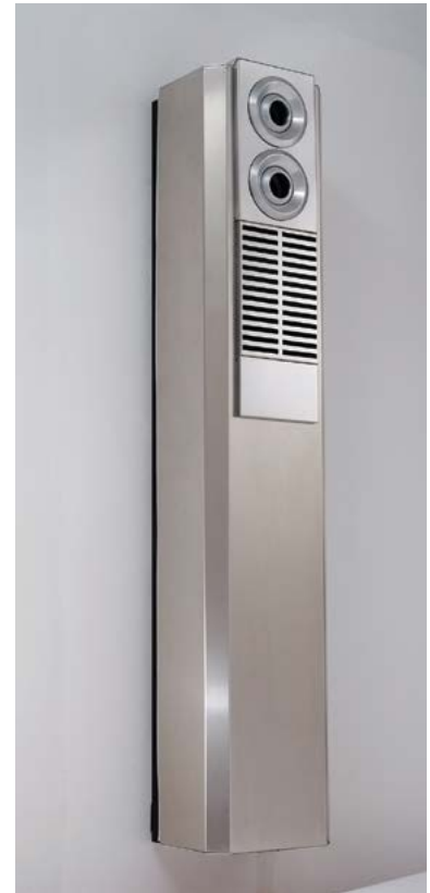
↑ The 'Vertical' Air Conditioner. A slim line all-in-one heating, cooling, ventilation and dehumidification system.